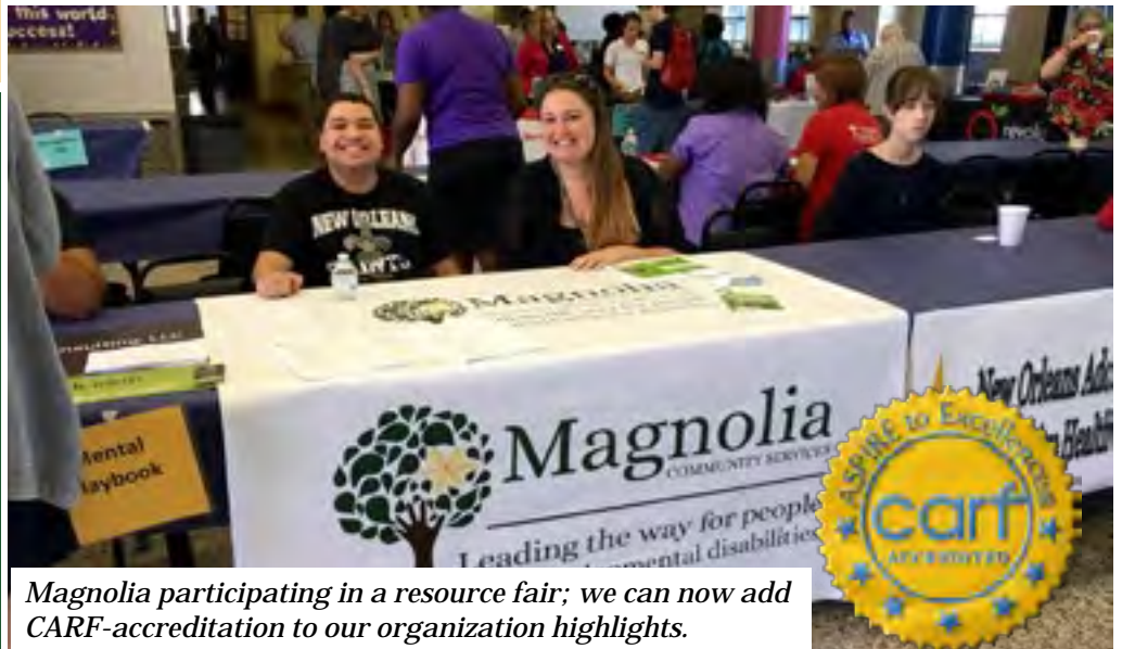
Magnolia participating in a resource fair; we can now add CARF-accreditation to our organization highlights.

Magnolia has earned accreditation from CARF International, an independent, nonprofit accreditor of health and human services organizations. CARF accreditation identifies Magnolia as an organization meeting internationally developed standards in the following areas: